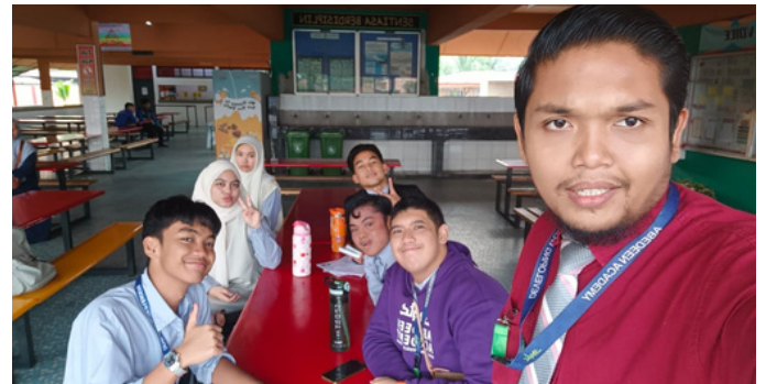
Abedeen Private Secondary School